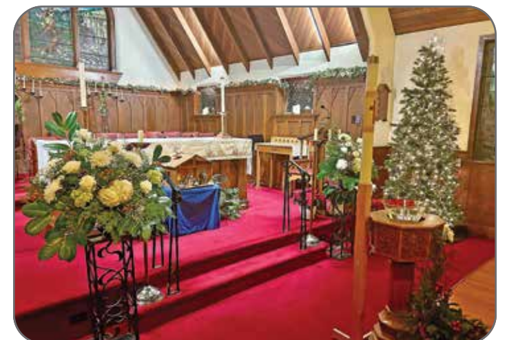
Beautiful St. Francis at Christmas.