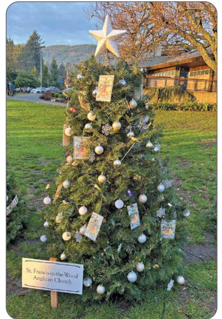
St. Francis tree at Dundarave.