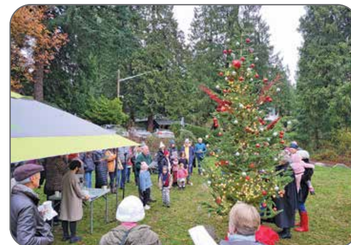
Tree on Green gathering.