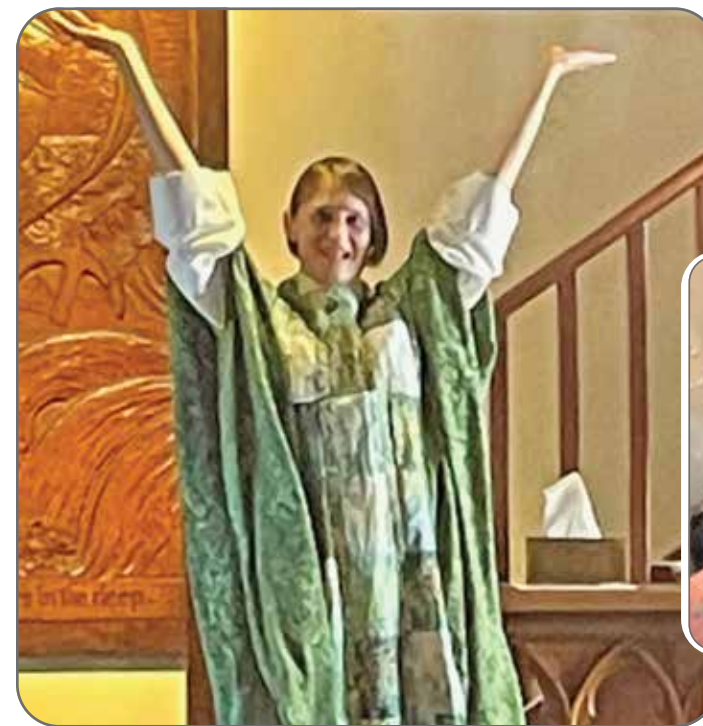
Ready for her party.