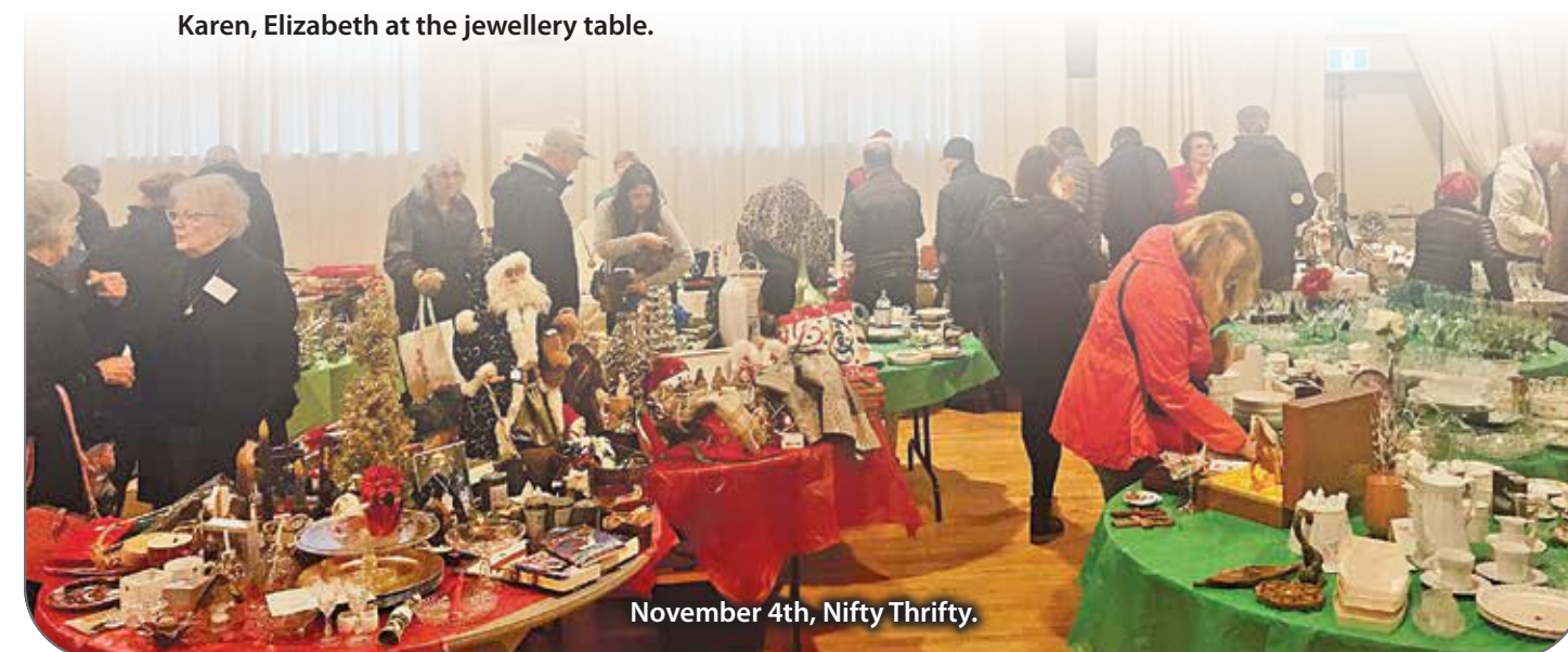
November 4th, Nifty Thrifty.