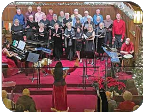
Full choir Dec 1st.